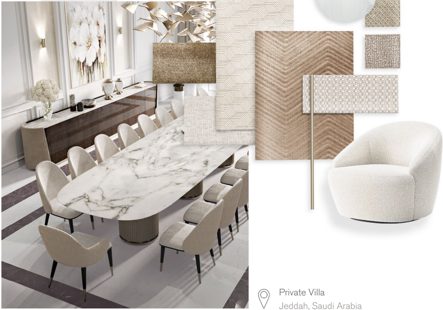
Private Villa Jeddah, Saudi Arabia