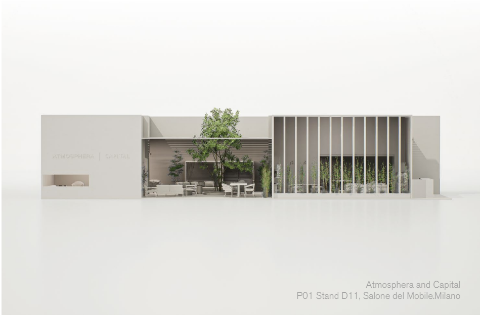
Atmosfera and Capital P01 Stand D11, Salone del Mobile.Milano